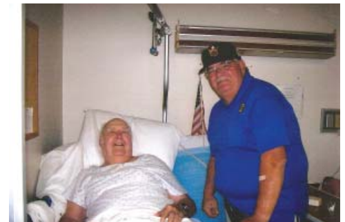
Covina Baseball Team visited the Yountville Veterans Hospital (August 6, 2007)