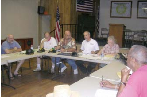
First Executive Board Meeting (August 3, 2007)